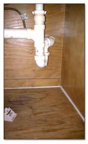
Monitor under a well-sealed sink