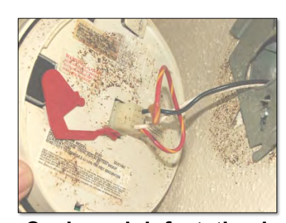
Cockroach infestation in a smoke detector

➤ Lead people to overreact and ignore pesticide labels